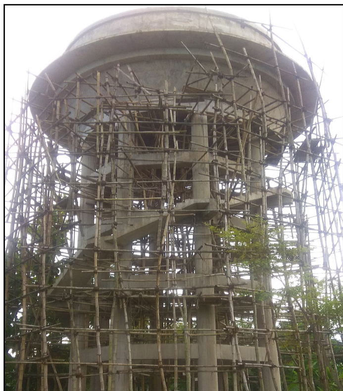
Construction of ESR in Hailkandi