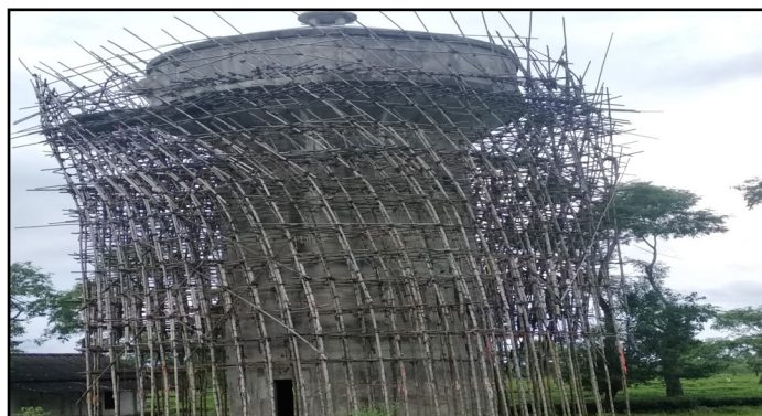
Construction of ESR in Jorhat