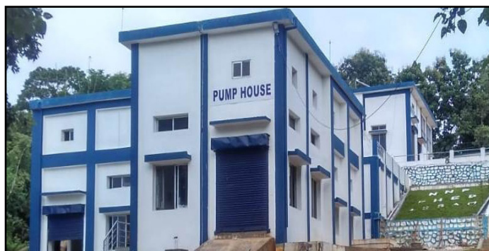
Pump House in Kamrup(M)