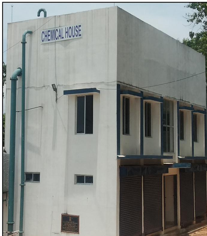
Chemical House in Kamrup