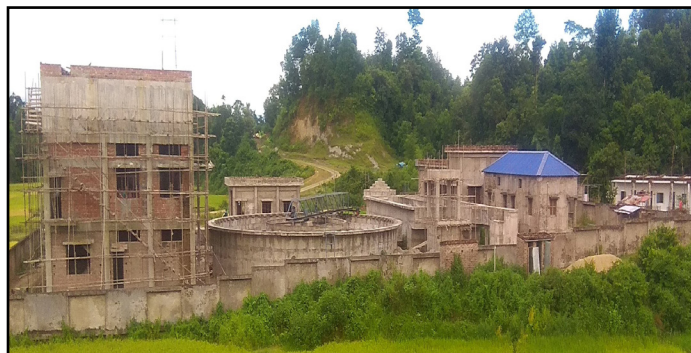
Water Treatment Plant in Hailakandi