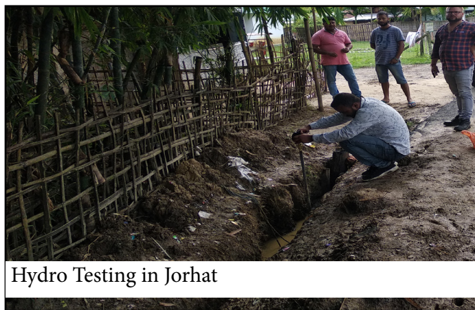
Hydro Testing in Jorhat