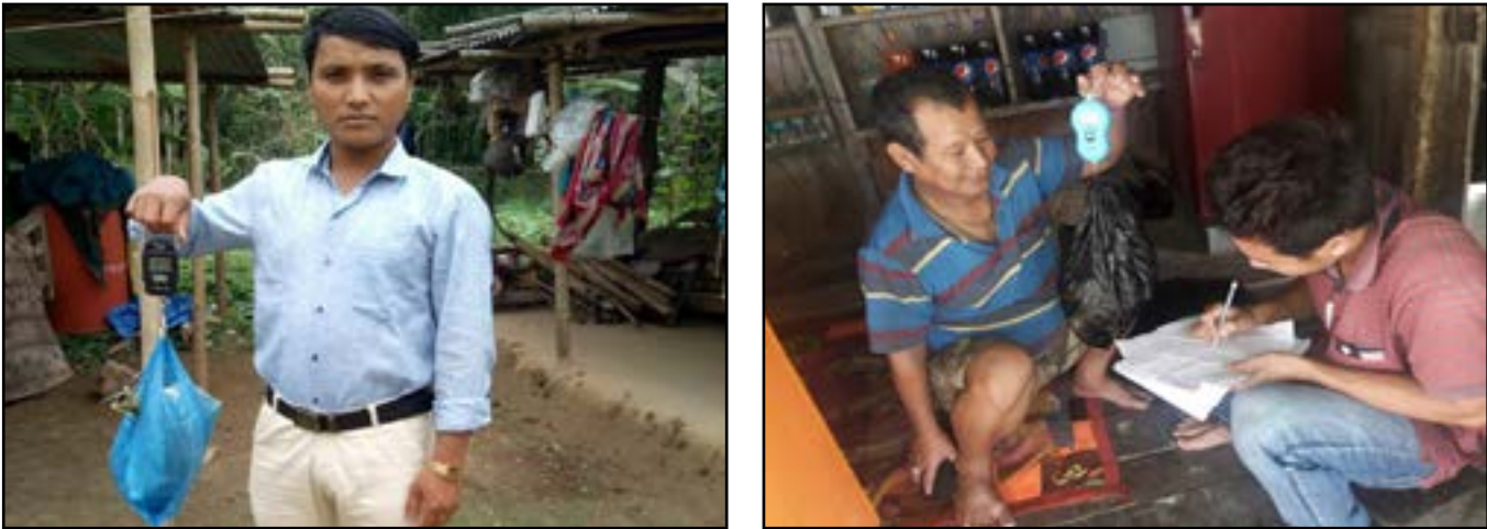
Summary of Community Contribution collection of Batch I & II Districts as on 31 st May 2019