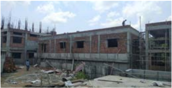
Water Treatment Plant at Hailakandi