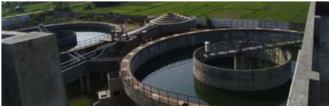
Water Treatment Plant at Jorhat