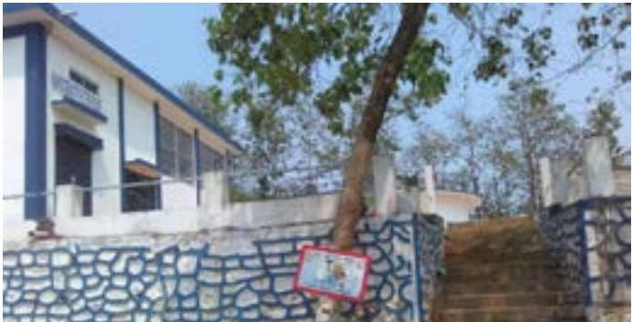
Water Treatment Plant in Chandrapur, Kamrup