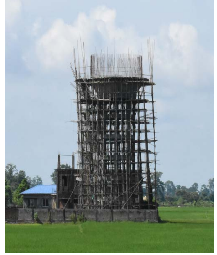
Construction of ESR in Jorhat