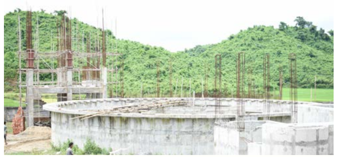
Water Treatment Plant in Hailakandi

Water Treatment Plant in Chandrapur, Kamrup